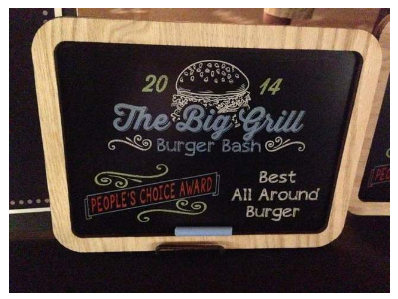
Roseville's Lazybones Smokehouse received the most votes in the category of 'best all around burger' at Friday's Big Grill Burger Bash in Royal Oak.

MELODY BAETENS THE DETROIT NEWS 5 COMMENTS